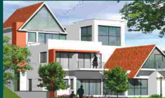
SUNNY ISLES Vizag, Andhra Pradesh