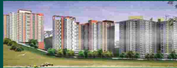
PANORAMA HILLS (GLOBAL ENTROPOLIS) Vizag