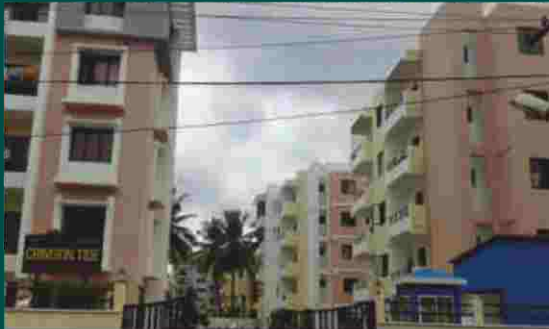
CRIMSON TIDE R. T. Nagar, Bangalore