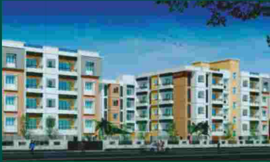
ICON Old Mahabalipuram Road, Chennai